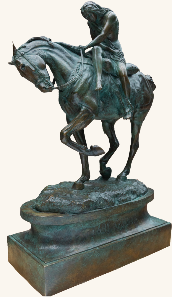
Anna Vaughn Hyatt Huntington (1876 - 1973) b. Cambridge, MA

He Said, She Said c.1950 oil on board Gift from 1950 Springville Junior High School Eighth Grade Class