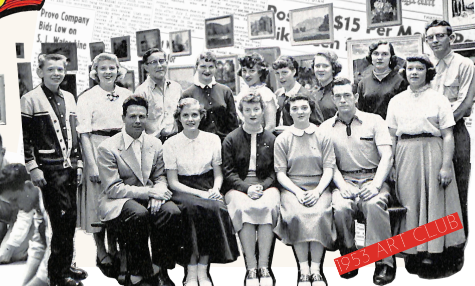
1955 ART CLUB