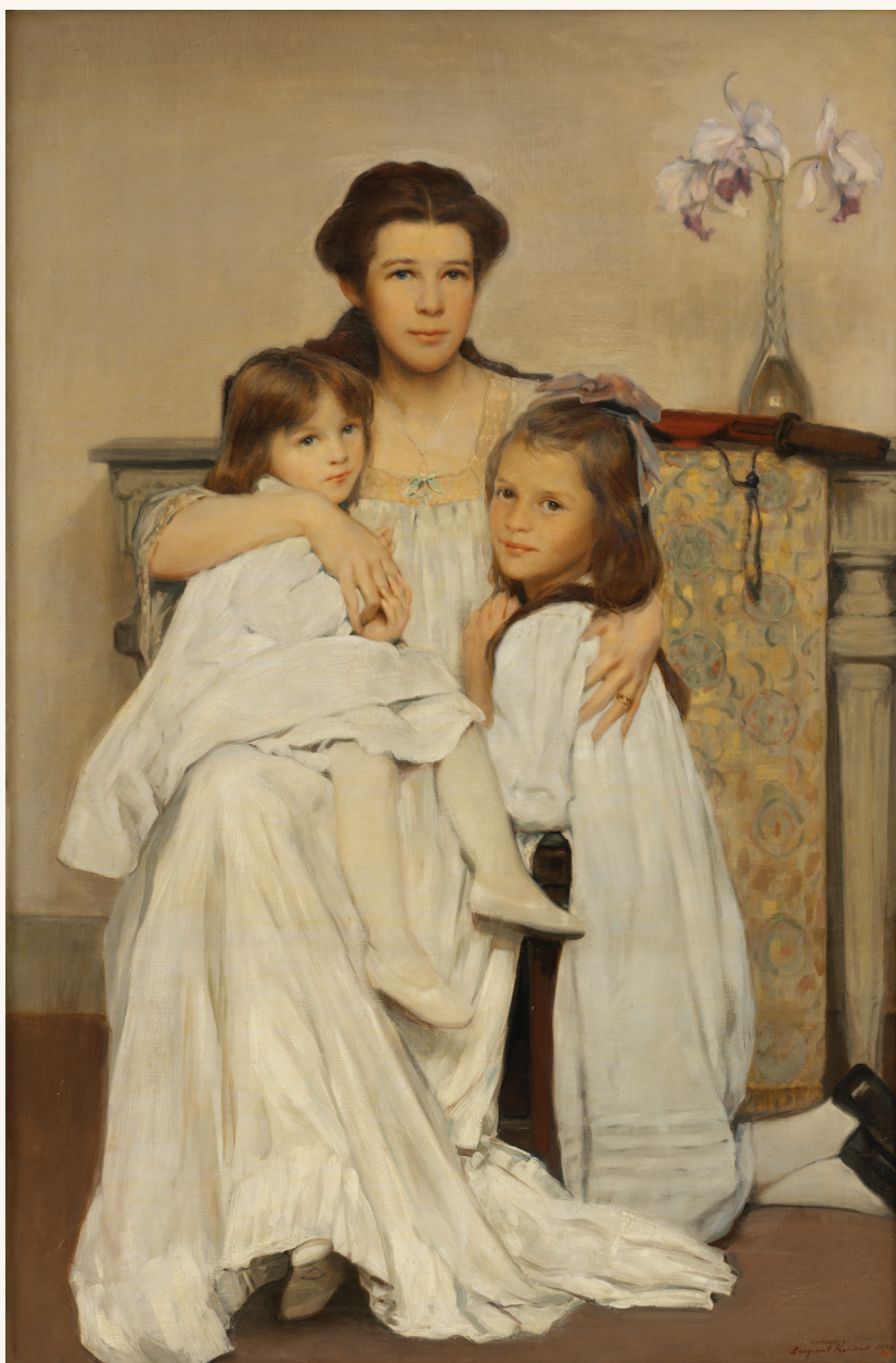
William Sergeant Kendall (1869 - 1938) b. Spuyten Duyvil, NY

The Artist's Wife and Daughters 1906 oil on canvas Gift from 1938 Springville High School Junior Class