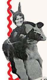
Some Red Devil

"When we leave high school we shall take away with us the memory of these paintings and we shall return time and time again to enjoy their beauty."