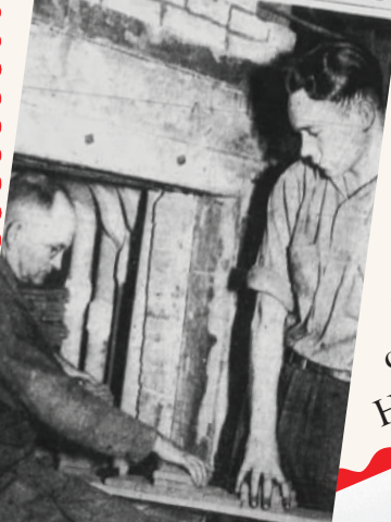
Helping to Beautify Building