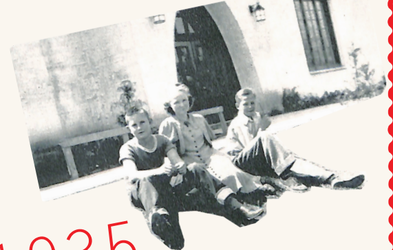
1935 Breaking Ground