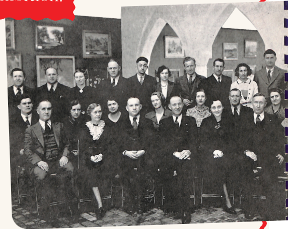
cohort in Museum